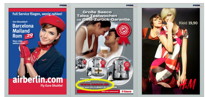
(a) (b) (c)