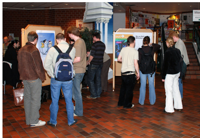
Figure 4: Evaluation booth at the student cafeteria of the University of Oldenburg.

related to the posters. An additional DNS server on the laptop allowed entering standard URLs (e.g. cebit.com) to access the prepared web pages. The WLAN access point was connected to the laptop to ensure reliable wireless network access for the mobile devices.