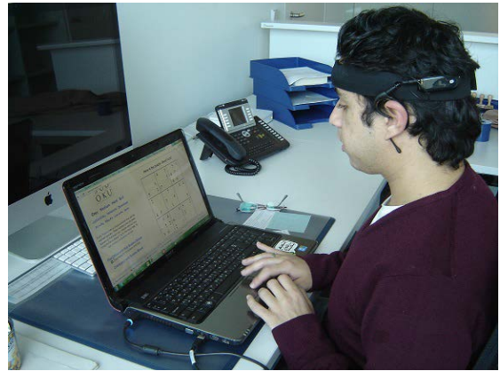
Figure 1. A participant playing the Sudoku task during the user study

proprietary algorithm to produce outputs which are only relative to each other.